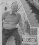
FORMER Halifax mayor Len Pitt

The Oakland Road wharf, once a treasured city landmark, has been reduced to a hazardous eyesore. (Darrow)